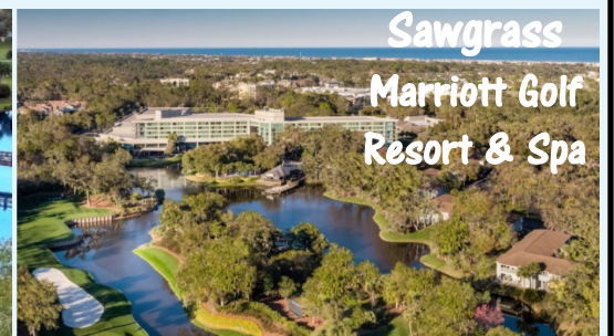
Sawgrass Marriott Golf Resort & Spa