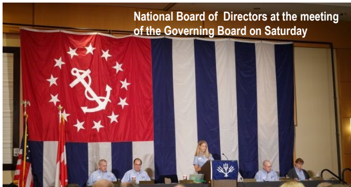
National Board of Directors at the meeting of the Governing Board on Saturday

Annual Meeting February 19-27, 2022 Ponte Vedra, Florida