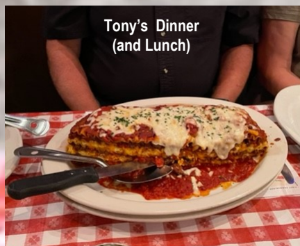
Tony's Dinner (and Lunch)